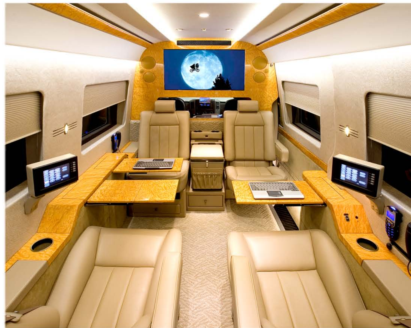
MULTIPASSENGER VEHICLE Becker JetVan

AMONG BUSINESS-CLASS conveyances, the old-fashioned van is hardly the stuff of CEO daydreams. It is more likely to evoke queasy experiences in airport parking shuttles and sightseeing tour buses. This, however, is no old-fashioned van. With lavish interior appointments and a full contingent of cutting-edge technology, the Becker JetVan lies somewhere between Air Force One and a Bentley Arnage, a rolling refuge that is one part corner office and one part private club.